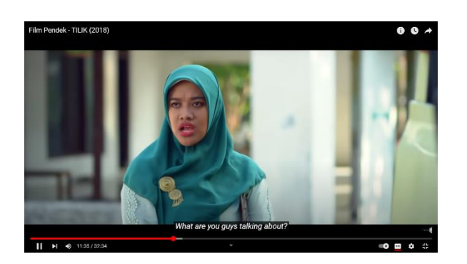
Figure 1. Short Film Tilik (2018)

It can be seen from the sample data from a conversation in the film Tilik below: