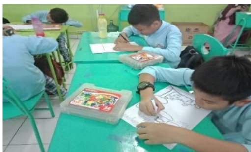
Figure 1 Learning process at Al-Firdaus

Management of student learning time at Al-Firdaus elementary school one week and 5 days of school entry is a long enough time for researchers, known as full day school. Students feel at home and enjoy learning while playing (Obs.10). The management of this learning is already clear that this school reflects indicators of child-friendly schools. In the morning the teacher welcomes the students with a warm welcome accompanied by children's style music, and/or reciting Al Qur'an.