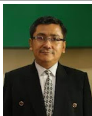
Munadi formal foto.jpg 22K

Conscientia Beam Journals <articlestatus@conscientiabeam.com>