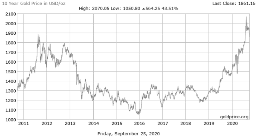
Figure 1. Gold Price Chart 2011 - 2020