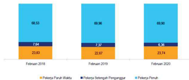
Figure 2. Percentage of working hours percentage February 2018 – 2020

Based on Figure 3, there is a decrease in working hours for full-time workers and underemployed workers, and there is an increase in the percentage of part-time workers. This condition will increase along with the work that is automated and carried out by the robot. Here is the Potential for job automation (Manyika et al., 2017):