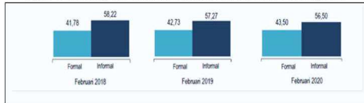
Figure 1. Percentage of Formal and Informal Workers as of February 2020

Figure 1. shows that formal employment has decreased from year to year, but informal employment has increased. Prospective scholars need briefing according to the current and future possibilities. The following is the percentage of working hours February 2018 - 2020: